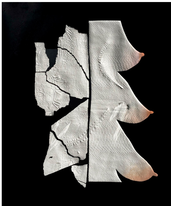
Rainbow Bruise 23 from the series Rainbow Bruise Unique photographic relief (embossed silver gelatin photogram, fabric dye), 2023, 23 x 19in