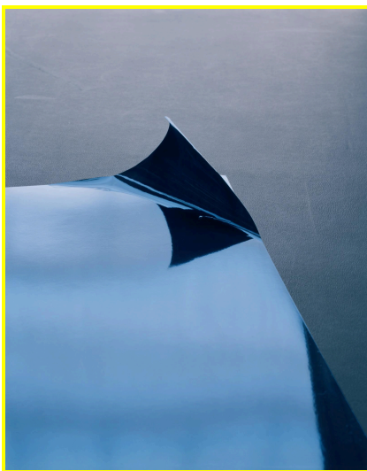
Peel On Table © Phil Chang, 2007

Phil Chang's Process, Object, Residue , blurs the line between the stages of artistic labor that occur in private and public spaces where art can be made and exhibited, and the economics that determine the value of an artwork.